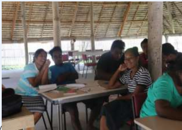
Students smiling during the Workshop

A training was carried out in Maiana by Officials from TAK in collaboration with the Marine Division, and the Kiribati Red Cross Society, on the 20 th to 24 th April 2020. This is done as a part of the capacity building development program to support the game fishing initiative, as part of the ecotourism venture on the island.