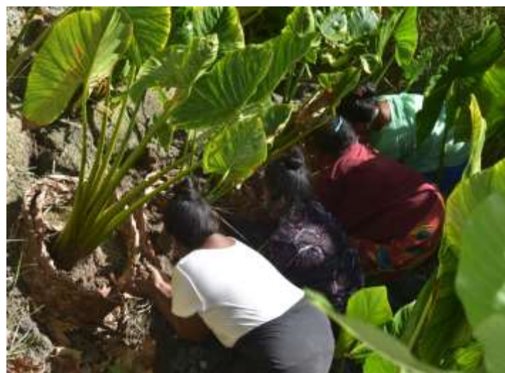
Nurturing the babai pits

With last knowledge and skills collected last visit, they have been reviewed and ready for the next step to be transformed into a "Knowledge Book," gained from the island of Maiana.