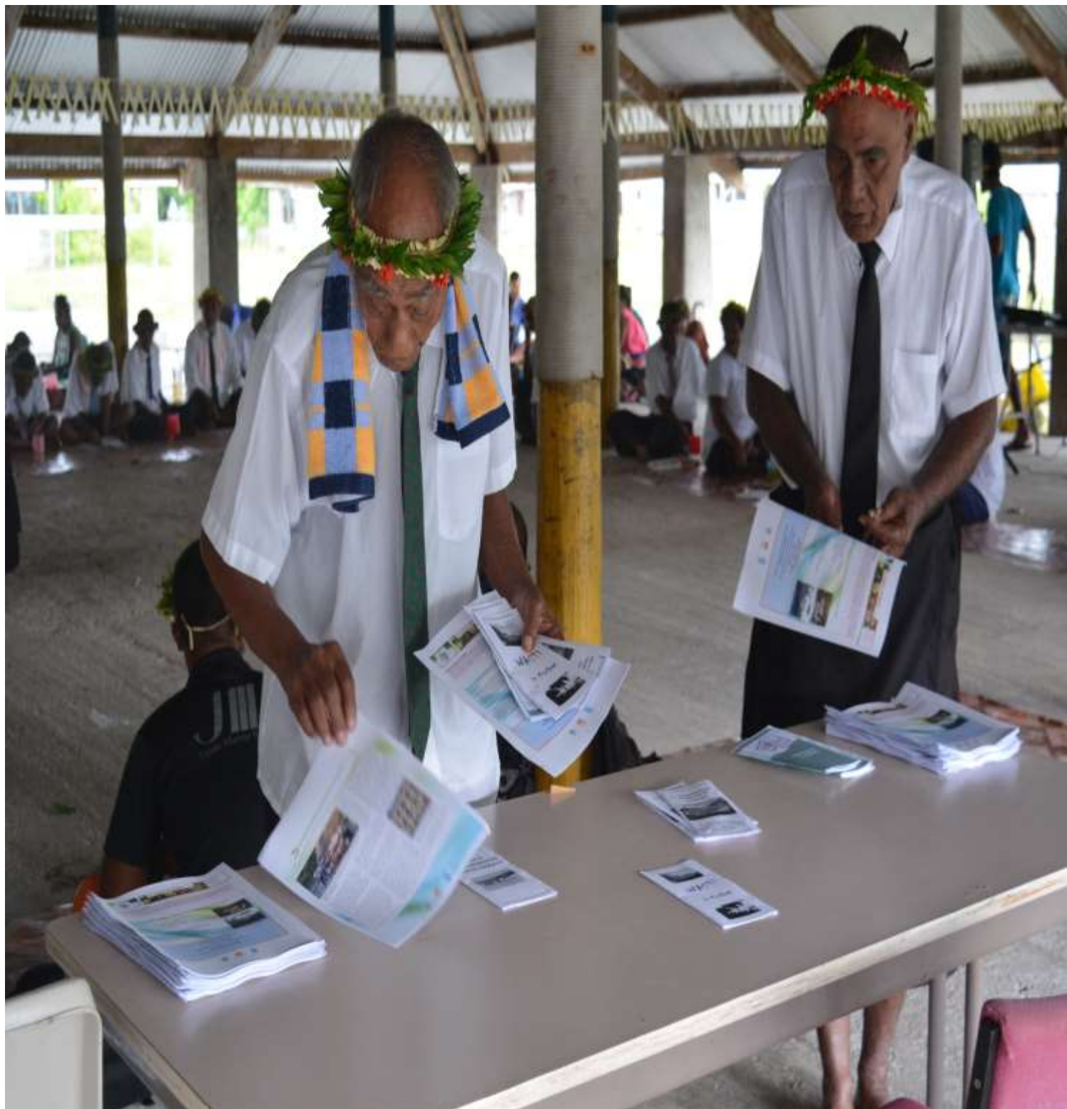
Unimwane (Old Men) from the Bau ni Maiana Council exploring displayed brochures by ECD.