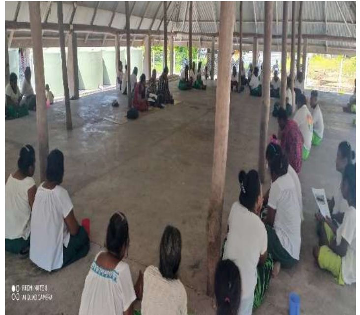
Below: Workshop with a community at Tabiang

June 10, 2020: On the 8th to 31st May, 2020, three officials from the Coastal Fisheries Division at Tanaea had visited Abemama to undertake sites survey for the establishment of mini hatchery set-up, monitoring and evaluation of sandfish and giant clams deployed last November. The team also conducted a workshop with some targeted communities on farming management practices. From the site monitoring, the team concluded that these sandfish and giant clams taken from Tanaea last year were severely damaged while some of the pen components went missing. This could have happened due to bad weather. To address this issue, the team recommended an awareness program conducted throughout the island so locals and communities are aware of the essentialities of those pens for community support and protection. The team had surveyed some potential sites for further recommendation to the appropriate authorities. The workshop of sandfish farming was also a way in encouraging other villages to outsource this farming at their respective villages for economic benefits and livelihood support. Locals at North Tabiang expressed their gratitude to the team for piloting their village in this initiative and look forward to future visits.