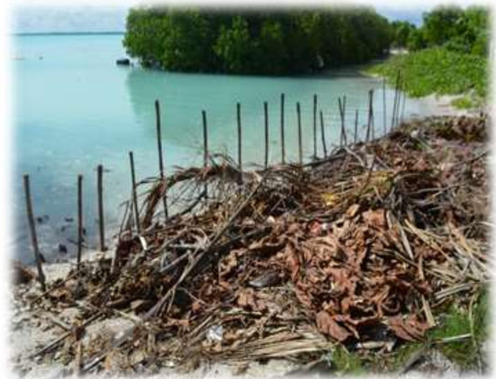
Pic above: A constuction of 'te buibui' also known as a local seawall.