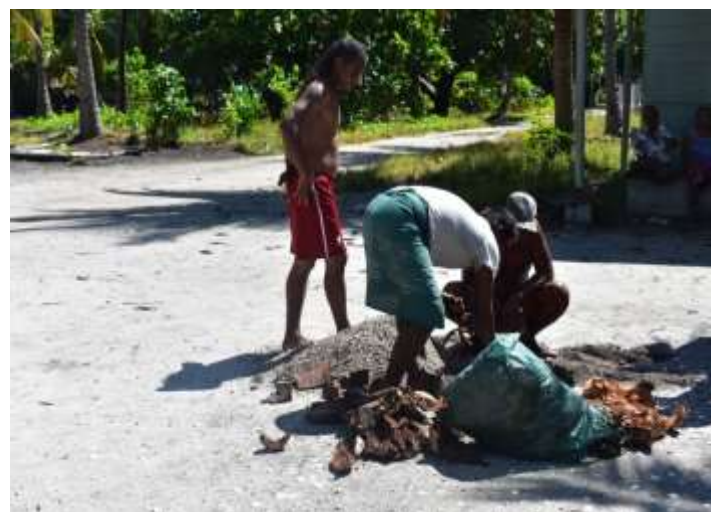
Plantation program at Buota Village, Maiana