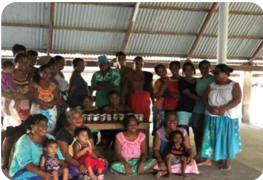
Picture: Villagers from Kabangaki, Abemama smiling with their cooked bottled fishes.