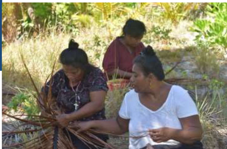
Teaching other women how to make "te bukinikana",

THE REVIVAL OF TRADITIONAL AND CUSTOM VALUES ARE RESISTANCE RESOURCES AGAINST CLIMATE CHANGE