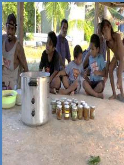
"Ensuring National Food Security In The Context of Global Climate Change"

The rollout of this project in July 2016 piloted in three islands; Maiana, Nonouti, and Abemama had blessed these islands tremendously. With nine (9) stakeholders, the roles, goals, and aims of this project had been disseminated faster with skills and knowledge offered and earned for these islands and those who conducted the activities. It is with hope that by the end of this project, locals from these islands will be able to learn how to adapt the impacts of climate change with skills and researches done in enhancing their economic and livelihood resources.